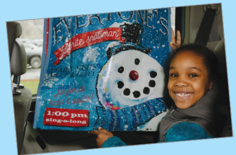
Children received a gift, healthy snacks, and a craft project at Goodwill's Youth Holiday Party "to-go" event.