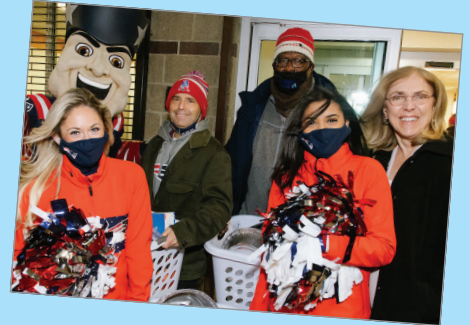
New England Patriots teamed up with Goodwill during the annual Thanksgiving-in-a-Basket event.

Goodwill created socially distant ways to continue its longstanding holiday traditions. These events are an additional way Goodwill supports program participants who are doing everything they can to support their families during the holidays and all year long.