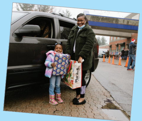
Your support brightened the holidays for so many people in the community.